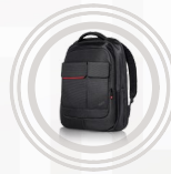
ThinkPad Professional Backpack