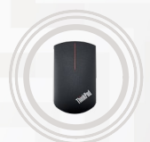
ThinkPad Precision Wireless Mouse