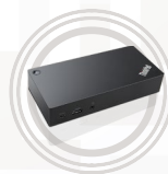
ThinkPad Thunderbolt 3 Dock